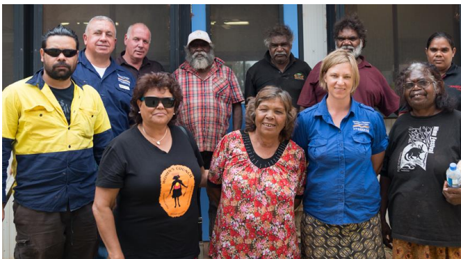
Irrunytju meeting of Anangu Directors, March, 2017