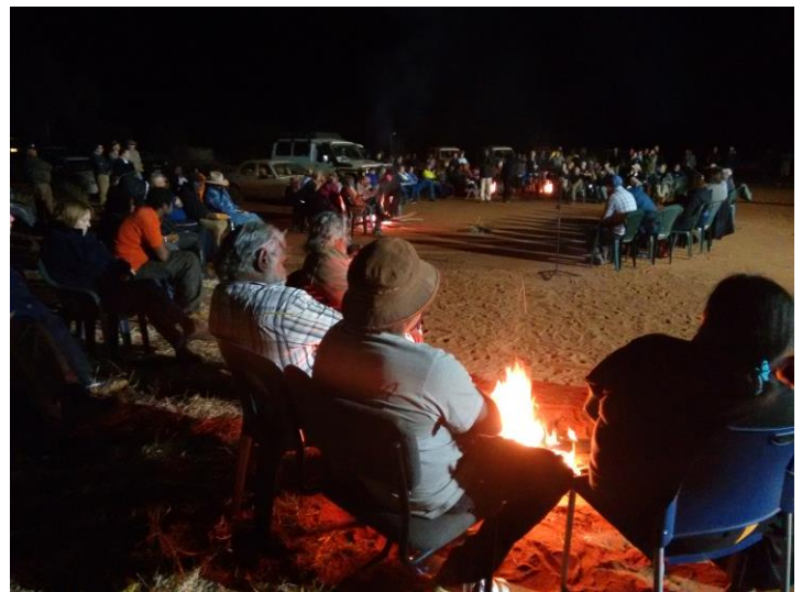
Anangu-tjuta from across the APY Lands spoke up to the South Australian Government during the Community Cabinet, 1 May, 2017

We have provided a collection of stories from Anangu who are on CDP, and the challenges some people are facing. We are working to make sure Anangu voices are being heard in this enquiry.