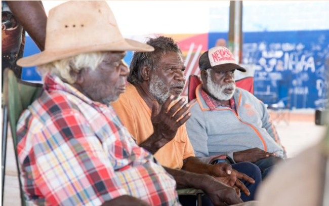
Docker River community meeting, March 2017