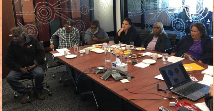
Anangu Reference Group members have undergone training in preparation for their role in reviewing IAS funding for the NPY region.

Empowered Communities is starting to make big steps forward in achieving ‘subsidiary’ - whereby Aboriginal people are directly involved in the decisions that affect them, their families and communities.