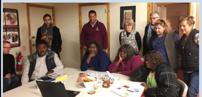
Visitors from Canberra’s Education Department met with education experts, including members of the PYEC.